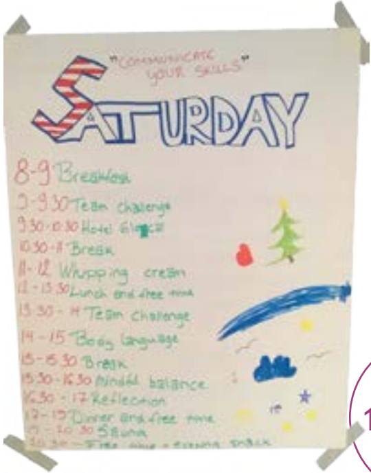
Each day had different topic

The next morning started with an introduction and 'getting to know' activities. The topic for the day was teamwork and how to learn. Friday, as far as the workshops are concerned, was very educational and productive. We learned a lot of new, useful things, such as learning styles and how to properly set a goal. The evening was interesting, since there was a special fashion show at which the models were representing their own countries in clothes of their own creation.