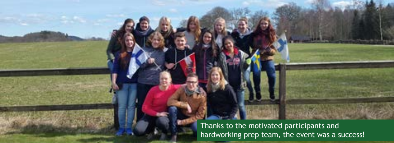
Thanks to the motivated participants and hardworking prep team, the event was a success!