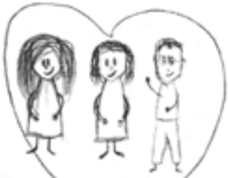
Portrait of the prep team

The brave ones jumped into the ice-cold lake