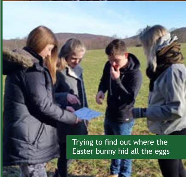
Trying to find out where the Easter bunny hid all the eggs